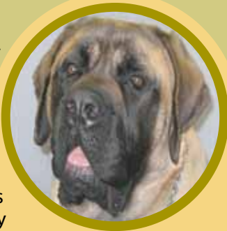
Logan, one of our therapy dogs